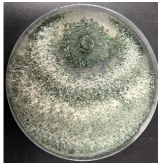
Figure 1: 7 days of Trichoderma asperellum on a PDA cultured medium