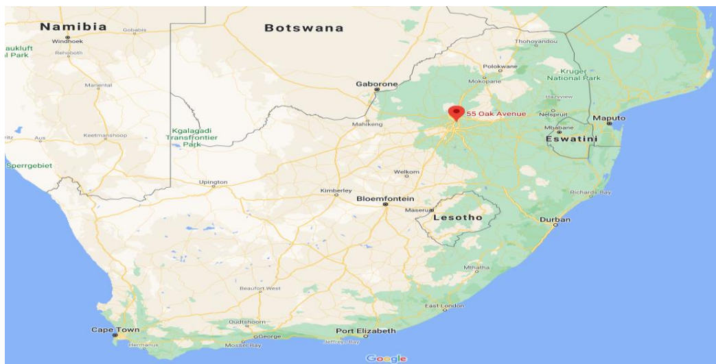
Figure1. Sampling location

This research takes place in South Africa, in the province of Gauteng. The operators Head office is based in Centurion, but the study was not limited to Western Cape, Eastern Cape, Northern Cape and other Provinces.